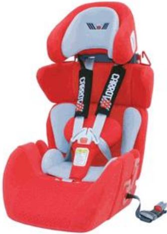
Convoid Carrot 3 Special Needs Child Restraint System