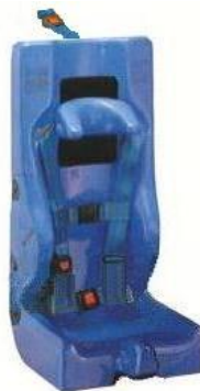
Tumble Forms Carrie Seat Basic, Junior