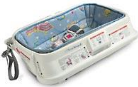
AngelRide Infant Car Bed