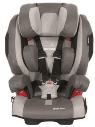
Thomashilfen Recaro Monza Nova 2 Reha Adaptive Booster-Type Car Seat