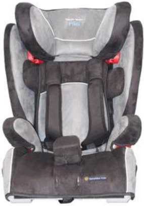
Snug Seat Pilot Special Needs Booster

Tip of the Week SPECIAL NEEDS CAR SEATS / TRANSPORTATION