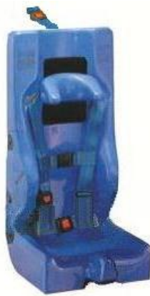
Tumble Forms Carrie Seat Basic, Preschool