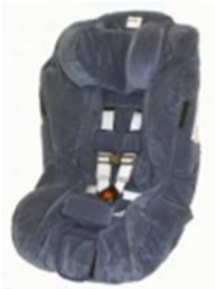
Traveller Plus Car Seat w/Seat Extension Onyx

Car Seats have an internal set of harnesses to secure the child in the seat, while the vehicle's seat belt is used to secure the car seat to the vehicle seat. Numotion offers all the top models of Special Needs Car Seats and Transportation Equipment.