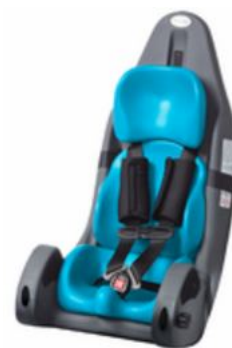
MPS Car Seat Small