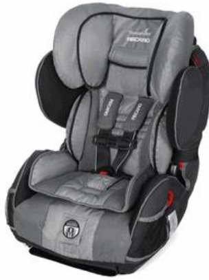
Thomashilfen Recaro Performance Sport Reha Car Seat