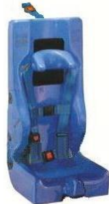
Tumble Forms Carrie Seat Only, Elementary