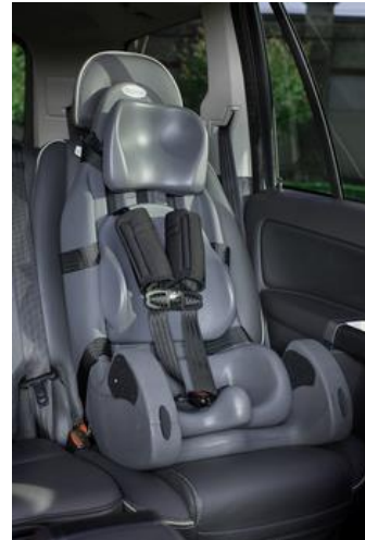
SPECIAL TOMATO MPS CAR SEAT

Tip of the Week SPECIAL NEEDS CAR SEATS / TRANSPORTATION