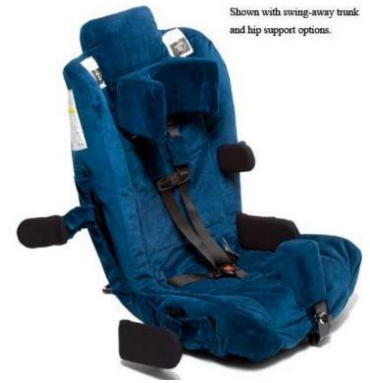
Columbia Medical Integrated Positioning System (IPS) Car Seat - Child