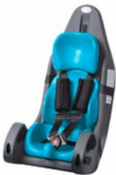
MPS Car Seat Large