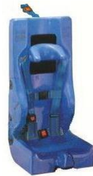
Tumble Forms Carrie Seat Basic, Small Adult