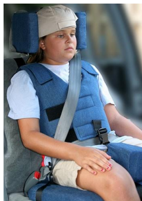
Churchill Backless Booster Seat