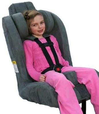
Roosevelt Car Seat