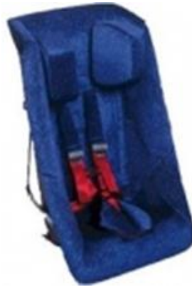
Columbia Car Seat