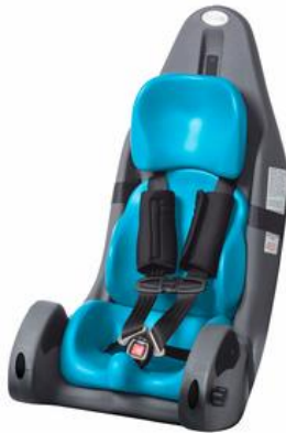
Special Tomato Large MPS Car Seat