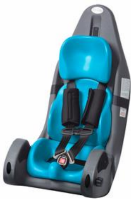
Special Tomato Small MPS Car Seat

All adaptive car seat listed here meet or exceed the US Federal Safety Standard MVSS 213 (Federal Motor Vehicle Safety Standard) where required.