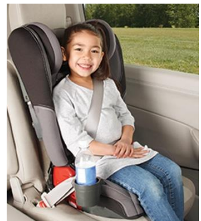
Diono Rainier Convertible + Booster Car Seat - Glacier