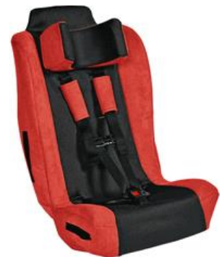
Columbia Medical Spirit Adjustable Positioning System(APS) Car Seat

Silver Linings Foundation is a nonprofit public charity with 501(c)(3) status. Our mission is to assist America's special needs population and their families by providing them with Medical Care Guides, education, resources, and the equipment they need. We need your support to do this.