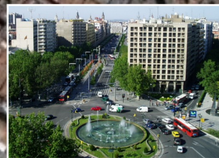
Plaza de Paraíso D&M PENTAGON