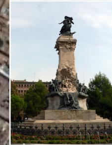
Plaza de los Sitios FACE OF ALA-LU