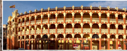
Plaza de Toros PLEIADES CITY

The purpose of this study is to present the evidence that the geometric ley-lines of the following temple layout is set to the Cydonia, Mars ley-lines. Pertaining to the Cydonia, Mars anomalies, there are 3 main pyramid structures that comprise the Martian Motif . There is the famous Face of Mars , the giant Pentagon Fortress and the Pleiadian Pyramid City . These 3 structures triangulate each other and would make up the core of a large metropolitan city on Earth. What is astonishing is that such a Martian Motif is seen implemented in the architecture of almost all the ancient civilizations on Earth. This started, at least based on the archeological record after the Flood of Noah with Babylon and Sumer. How the Martian Motif is tied to the ley-lines of ancient cities, temples and structures is that perhaps the lost knowledge and connection of the Martian civilization was conveyed to the few and 'selected' 'priestly' class on Earth that constitutes the Secret Societies, etc. This special class of humans are perhaps tasked at keeping the legacy, lifeline and bloodline operational. Even now in the modern era, the same Cydonia, Mars motif is incorporated into the major capitals.