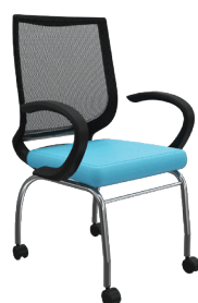
ML-H-4 A : 19" C : 18" E : 22"