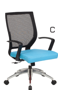
ML-H A : 19" C : 17 1 / 2 " - 22 1 / 2 " E : 22"