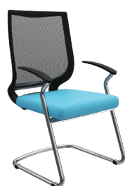
ML-H-6 A : 19" C : 18" E : 22"