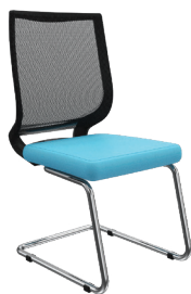
ML-H-2 A : 19" C : 18" E : 22"