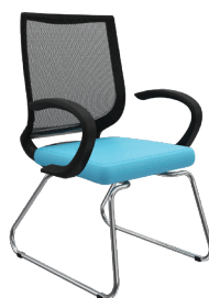
ML-H-3 A : 19" C : 18" E : 22"