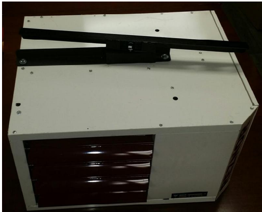
Top side View Lower Bracket