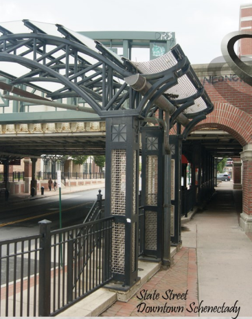
Slate Street Downtown Schenectady