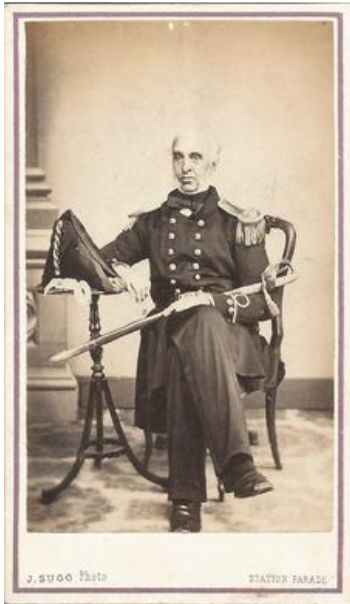
A British Veteran Of the 1812 War

in the War of 1812, learns of Bacon's plan and responds by sending local boats to surround the Creole in port.