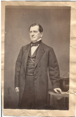
Joshua Giddings (1795-1864)

The Congressional conflict is sparked by the 75 year old ex-President, John Quincy Adams, the first and still foremost abolitionist in Washington, since rejoining the House in 1833.