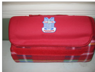
Roll -Up Blanket