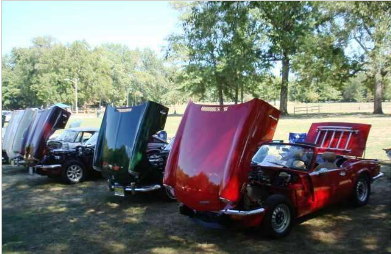
The lineup at FallFest