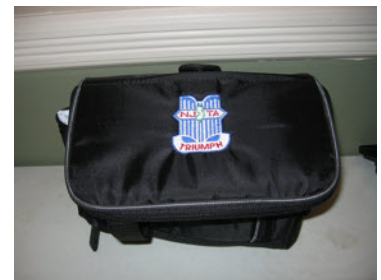
NJTA 6 Can Cooler