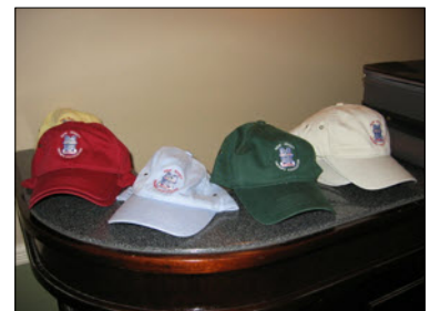
Stylish Baseball Caps