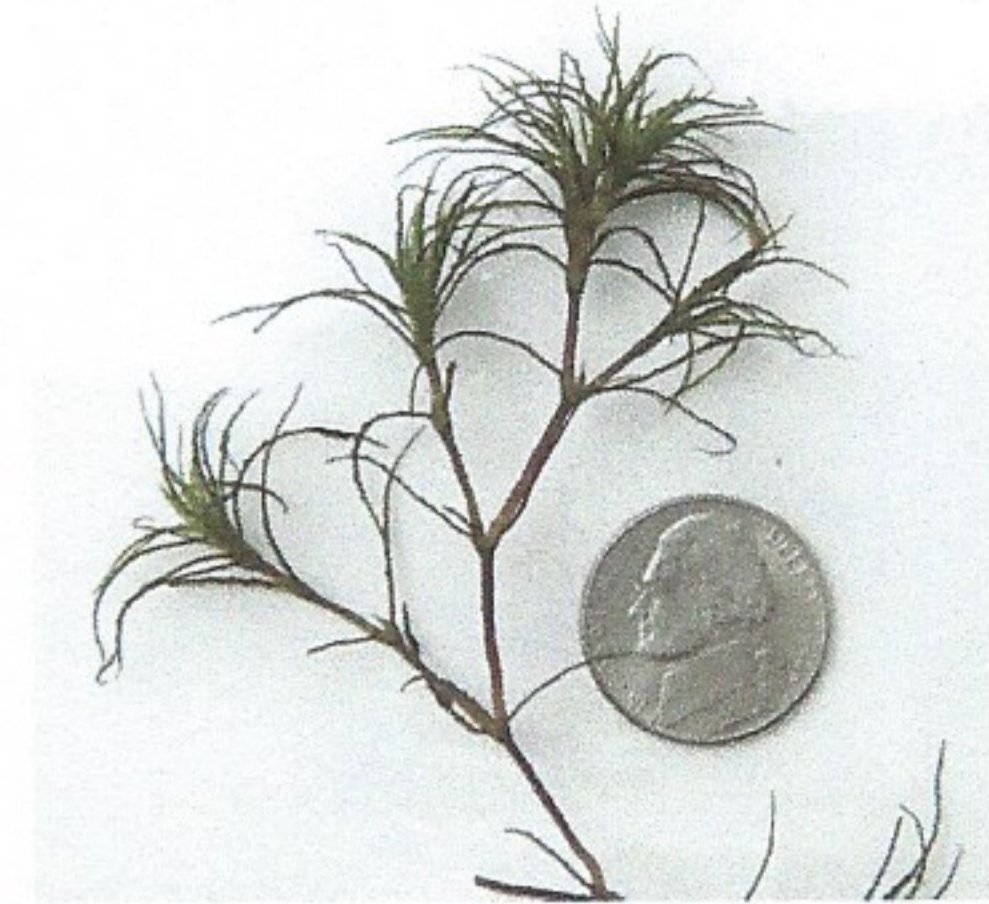
Brittle naiad is highly branched, and leaves are often curved.

North American Distribution: Ontario and the eastern and southeastern United States. One population has been reported from California.