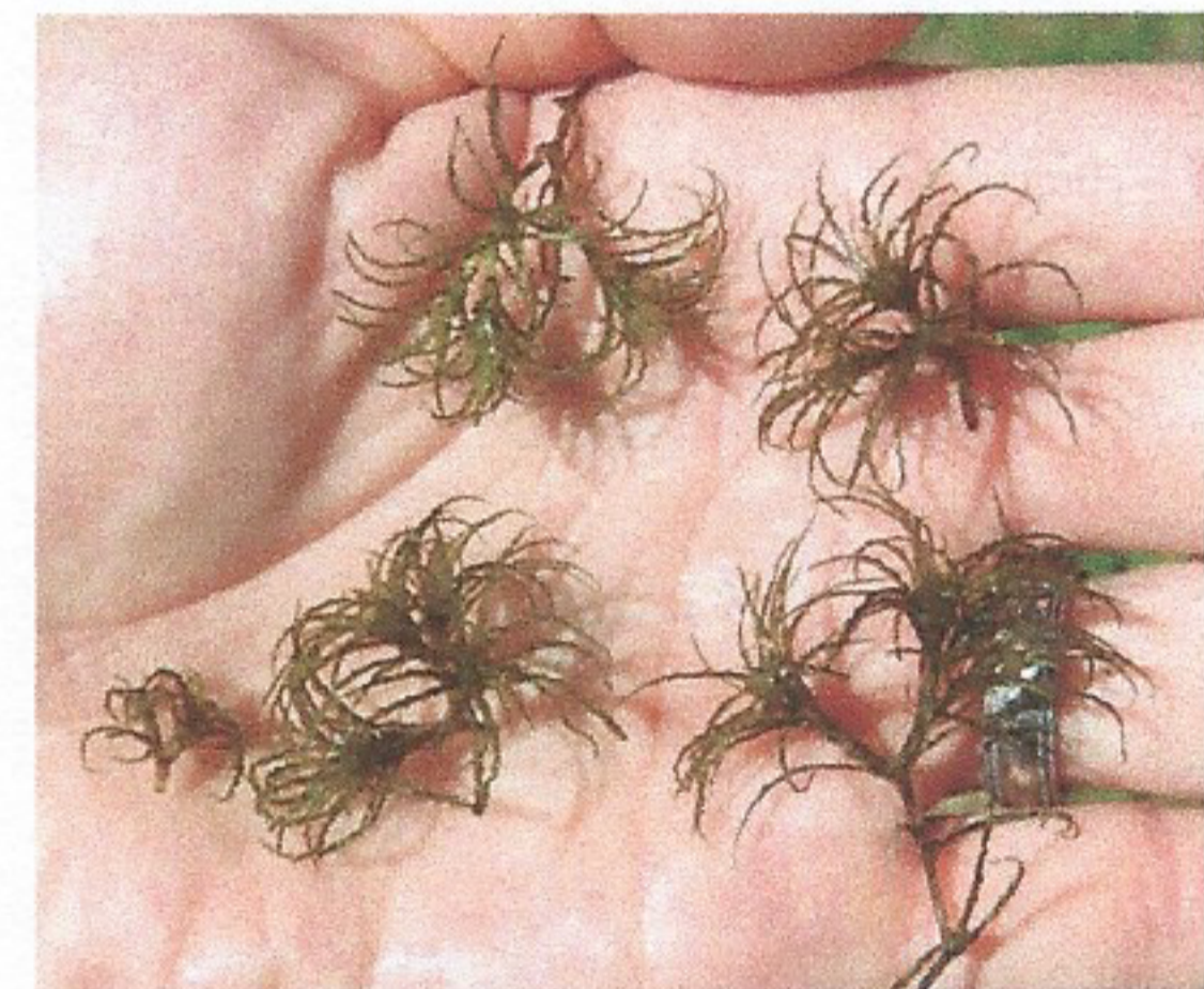
Brittle naiad readily breaks into small pieces, which help disperse its seeds.

This Quick Guide is part of a series on aquatic invasive species, and may be reproduced for educational purposes. Visit us at www.goldensandsrcd.org/our-work/water to download this series of handouts.