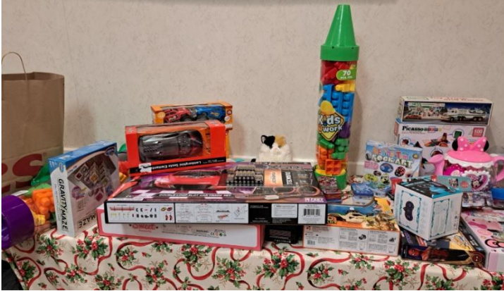
Toys for Tots