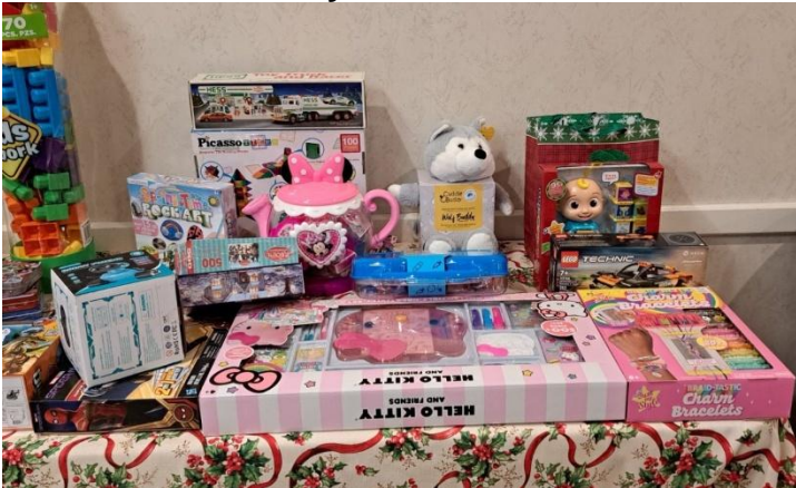
More Toys for Tots