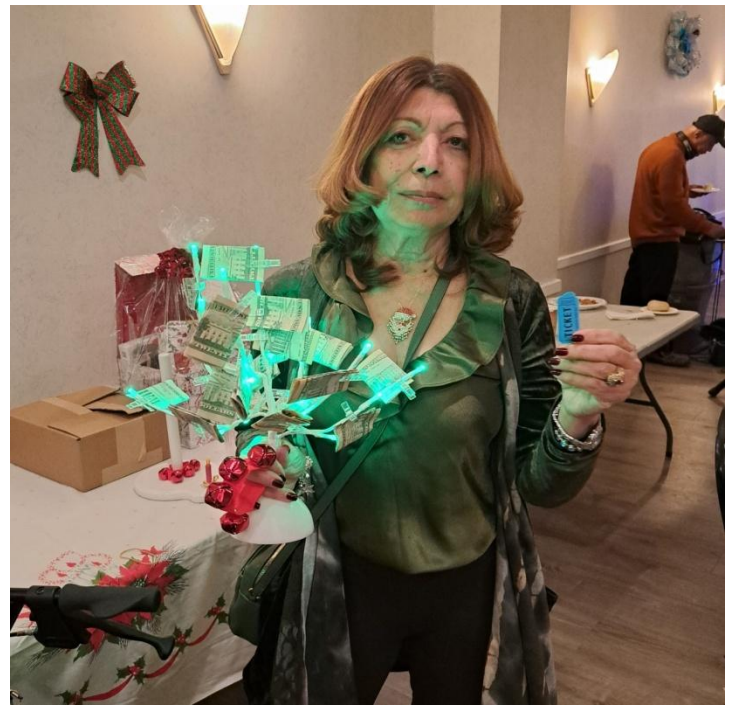
And the winner is .....