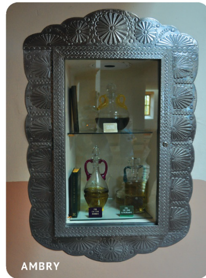
JOHAN VAN PARYS

A repository for the oils—often marked Olea Sanctae (“Holy Oils”)—is called an ambry . It is usually in a prominent church location near the baptismal font. Each year, when the oils are replaced, a priest, sacristan, or other person may absorb the old oil with cotton and burn it in a thurible or as part of the fire that begins the Easter Vigil. With special care, old oil can also be added to a large burning candle, like the sanctuary lamp. Reverence and safety are proper for whatever method of disposal is used. ●