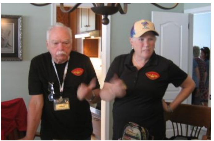
Snazzy new shirts

10/1/1915 Henry Ford Hospital opened 10/1/1917 Ist Fordson tractor was built 10/1/1955 Lincoln Continntal introduced 10/17/1955 First 1956 Tbird was assembled 1/4/1957 First Edsel was sold ( in FL) 10/8/1959 Ford Falcon went on sale 10/13/1960 Ford Econoline series introduced