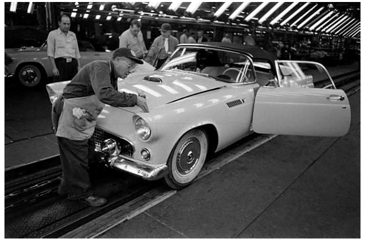
55 Production line - final inspection