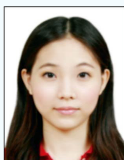
blurred, incorrect focus