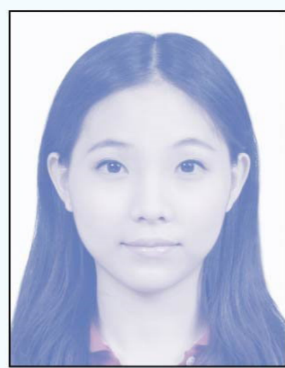
contrast too low, washed out color