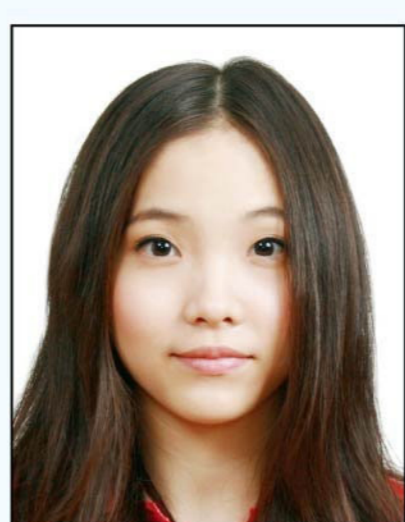
eyes or ears covered by hair