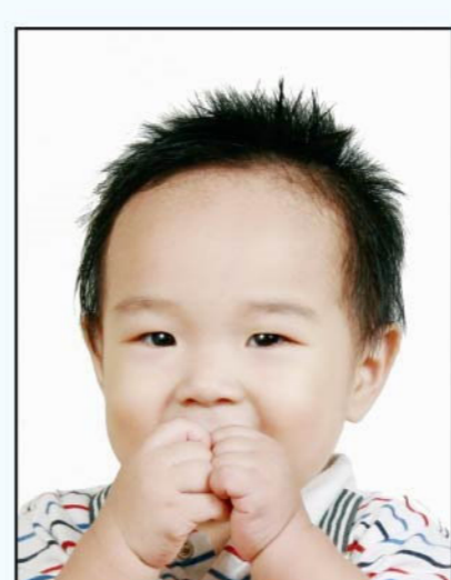
mouth covered by hands