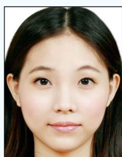
too close or hair touches the edge