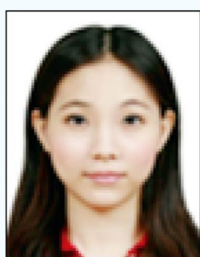
resolution too low