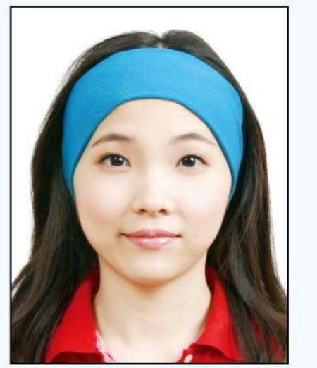
face and ears covered