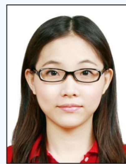
frames too heavy