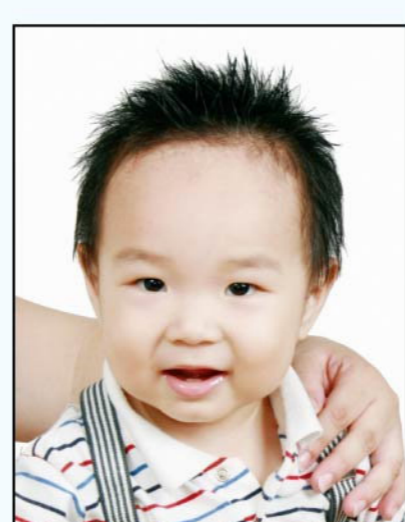
shows another person