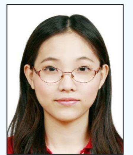
frames covering eyes