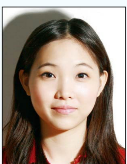
shadow behind the head