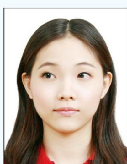
not looking directly forward