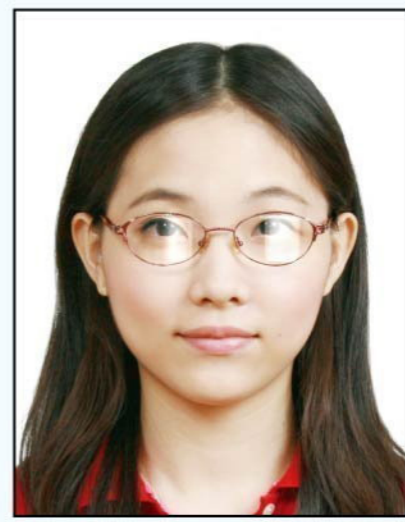
Flash reflection on lenses