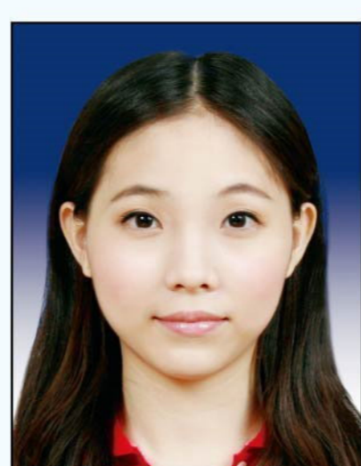
background colors are not identical