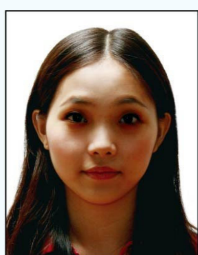
shadow across face