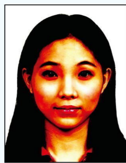
contrast too high