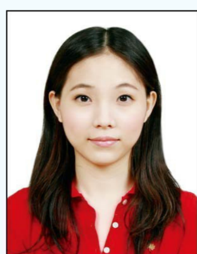
too far away