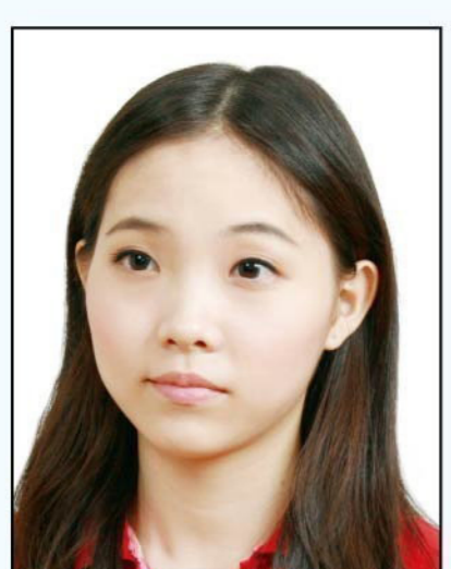
head not facing camera, looking away