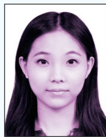
unnatural skin tones