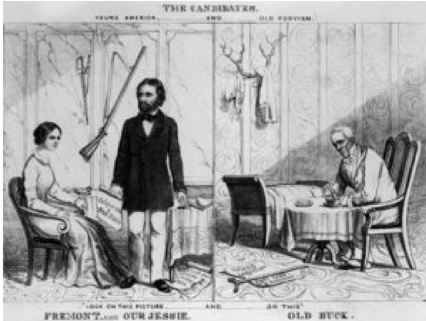
Top Script: The Candidates: Young America And Old Fogyism Bottom: Fremont And Our Jesse And Old Buck Scrolls: F (California Free State/South Pass Route) B (Ostend Manifesto/Platte Ruffians)

Further efforts to gin up enthusiasm come in the way of campaign rallies, where cider is consumed, the crowd is encouraged to physically push around a ten foot in diameter sphere made of cloth, string and tape, plastered with campaign slogans (“keep the ball rolling”), all the while chanting a range of campaign slogans and songs. For “Old Buck,” there is The White House Chair :