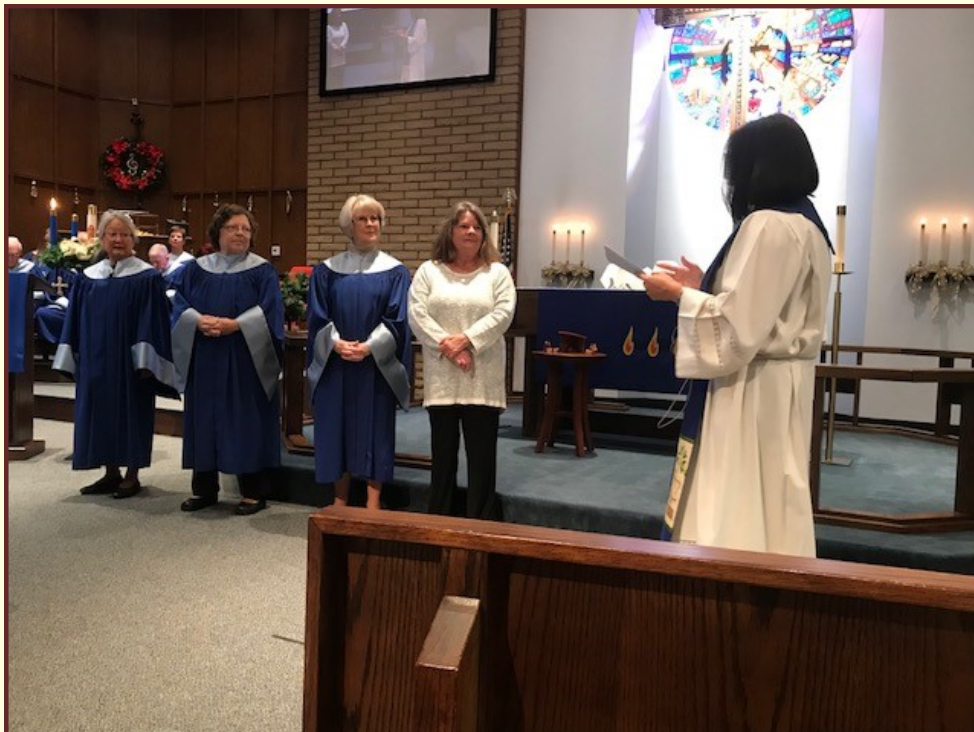
W.E.L.C.A. Board installation on Sunday, December 9, 2018