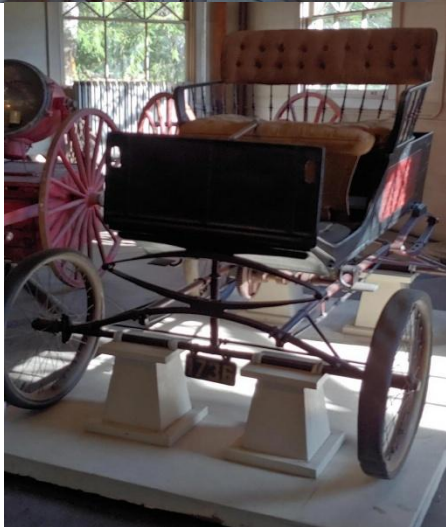
Henry Ford's Quadricycle ??