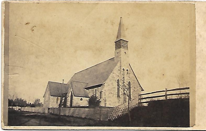
Germantown Church (Jr-2)

Along with the Enlightenment comes a growing sense that by relying on their own capacity to reason, individuals can shape their personal destinies, their societies and their government.