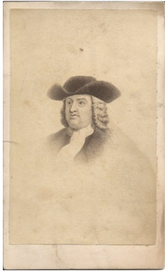
Quaker William Penn (1644-1718)

The Presbyterian Church is founded by the Scottish preacher, John Knox (1505-1572) and its theological roots are linked to John Calvin (1509-1564). But church governance here falls to a body of “elders” rather than to the members of the congregation as a whole. Hence its name, derived from the Greek word for elders – “presbyteros.” The Presbyterian Church appears in America around 1706, accompanying immigrants from Scotland. It takes hold mainly in North Carolina, Pennsylvania and the western territories. During the 1830’s “new school and old school” Presbyterians will divide, with the former evolving into Unitarians.