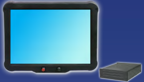
Multistream II Touch screen Recorder