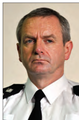
Iain Livingstone Interim Chief Constable