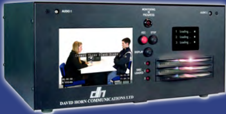
Multistream II Static Recorder