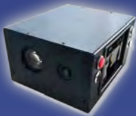
Ultra Portable Recorder