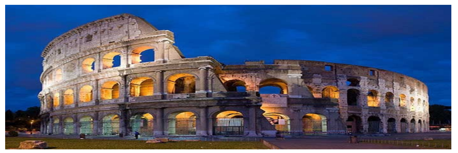
Today, after breakfast, we will begin our tour of some of the most important and popular sites of Ancient & Monumental Rome.

Coliseum, Located just east of the Roman Forum, the massive stone amphitheater was commissioned around A.D. 70-72 by Emperor Vespasian of the Flavian dynasty as a gift to the Roman people. In A.D. 80, Vespasian's son Titus opened the Coliseum—officially known as the Flavian Amphitheater—with 100 days of games, including gladiatorial combats and wild animal fights. Capitoline Hill: The Capitoline Hill is the smallest among the seven hills of Rome. Even though it is the smallest it played a huge part in the religious and political aspects of Rome since the founding of the city center.