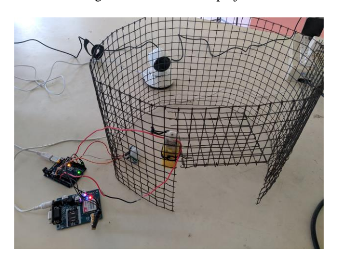
Fig 4: Hardware Interface