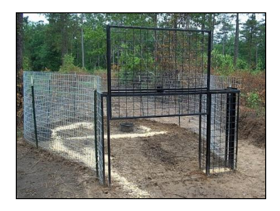
Fig 2: Trapping cage

The triggering signal will be sent in the form of dial tone from the dial pad of the user's phone. When user press a predefined number from his mobile keypad, it generates a unique tone which is heard at the GSM end. GSM module has an inbuilt DTMF decoder which converts his analog tone into digital value. This value is given as an input to microcontroller that triggers the DC motor connected to it which when rotates makes the door of the cage drop instantly.