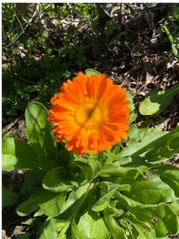
The first sunny bloom of calendula

Here are some pictures of the garden after the freezes: