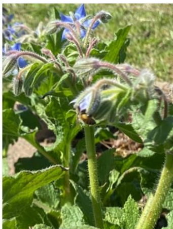
Our borage made a huge comeback after not showing up at all last year. Bees love it!