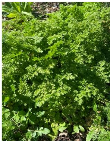
Beautiful chervil. Doesn't like heat. Come get some.