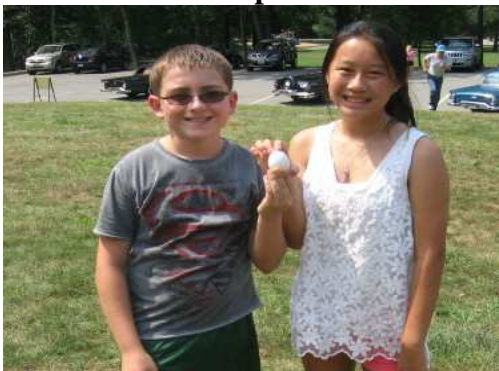
Winners of the egg toss