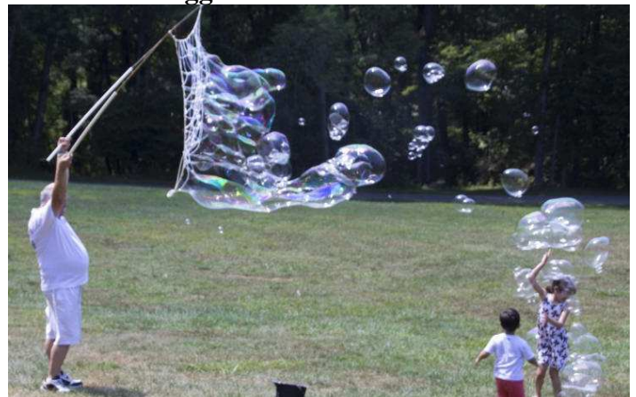
All the kids had fun