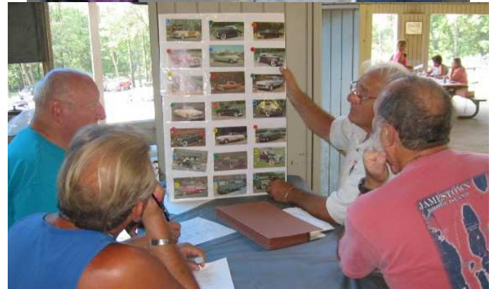
Men's Trivia-name that car