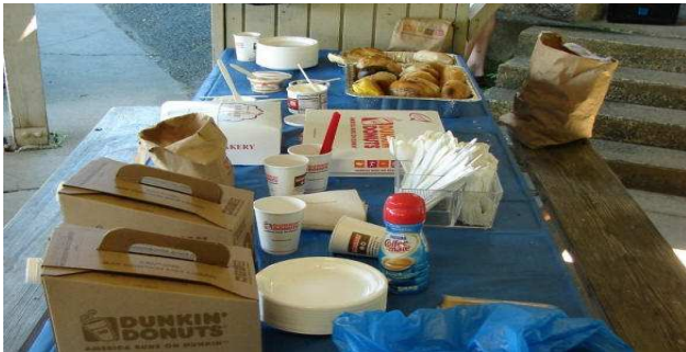
For the early risers