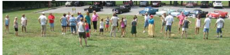
Egg Toss Initial Entrants

Interested in trying your Tbird in a Road Rally? There is one scheduled for 10/11 put on by two local sports car clubs. It's a tour of the Highlands. Info: www.highlandsroadralley.eventbrite.com