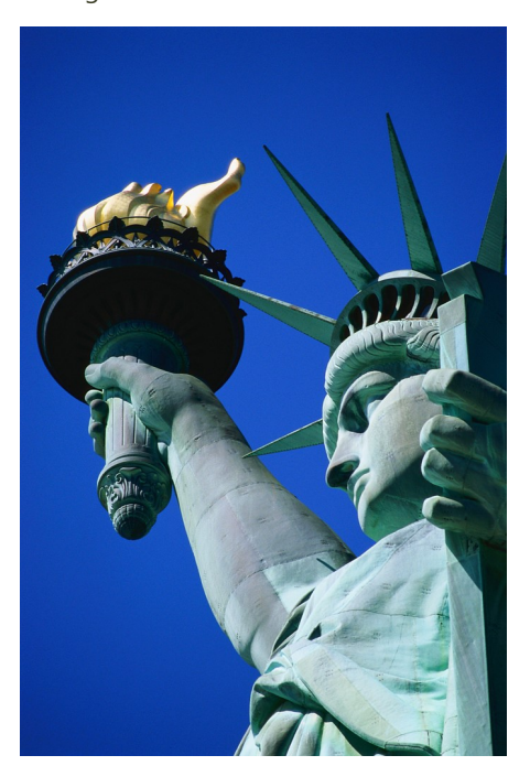
"Give me your tired, your poor, Your huddled masses yearning to breathe free, The wretched refuse of your teeming shore. Send these, the homeless, tempest-tossed to me, I lift my lamp beside the golden door!" This is the quote on the statue of liberty that welcomed millions of people to a land of freedom of religion.

America's founding documents are Judao-Christian because at one time most of our leaders believed in