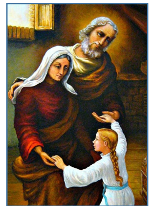
Feast Day: July 26