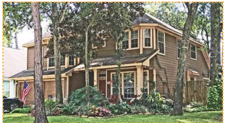
9315 Rhythm Lane