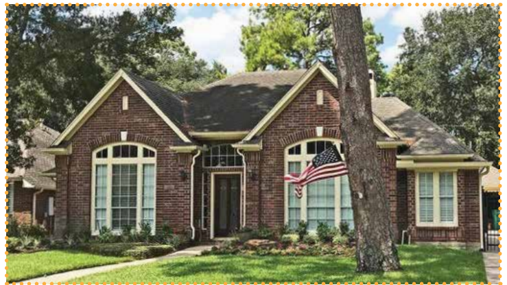
8910 Andante Drive