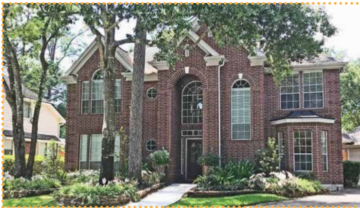
9011 Ensemble Court