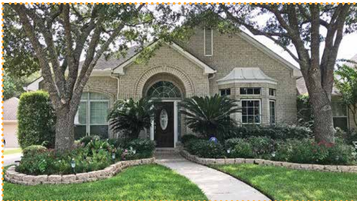
8619 Concerto Circle