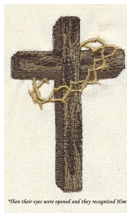
"Then their eyes were opened and they recognized Him"