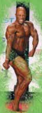
Guest Poser RD Caldwell Jr IFBB Lifetime Natural Pro Bodybuilder