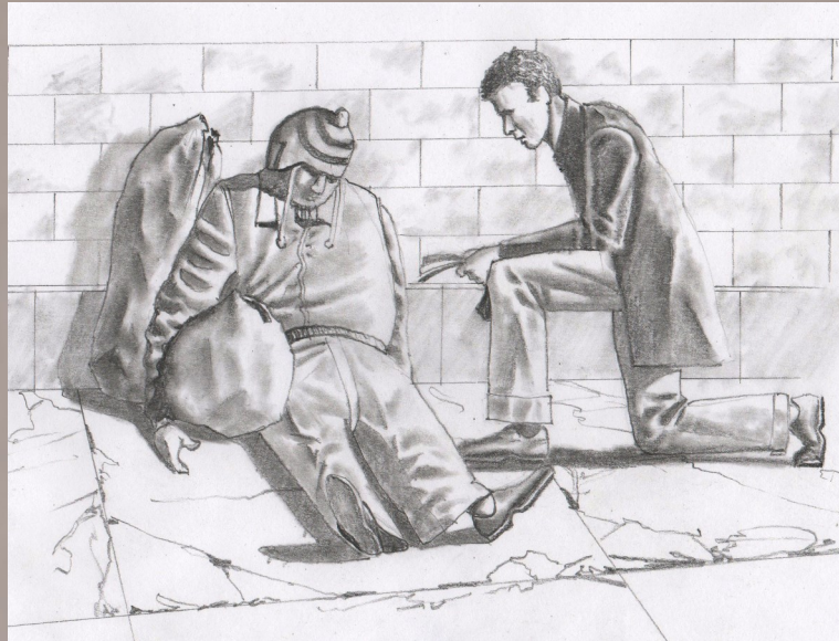
As tensions mount between the social classes we often wonder what we can do to help. You can give a man a sandwich and he will eat for a day, but if you win him to the Lord and get him in church you can completely change his life—if he is willing. We no longer live in a spiritual nation, or that spirit has taken a different form than Jehovah and Jesus Christ being God.

humble themselves, and pray, and seek my face, and turn from their wicked ways; then will I hear from heaven, and will forgive their sin, and will heal their land (2 Chronicles 7:14).