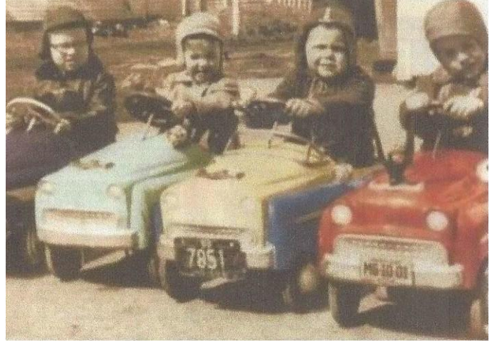
Future TBirders ?