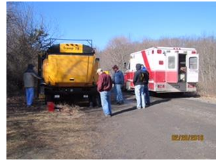
Bus ambulance, repair underway