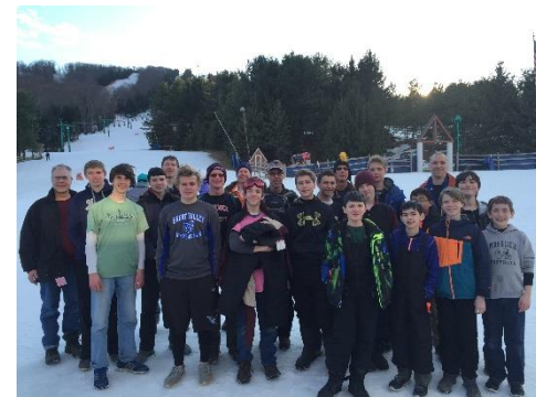
At Elk Mountain