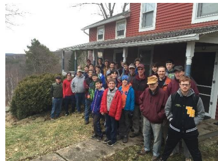
All together now