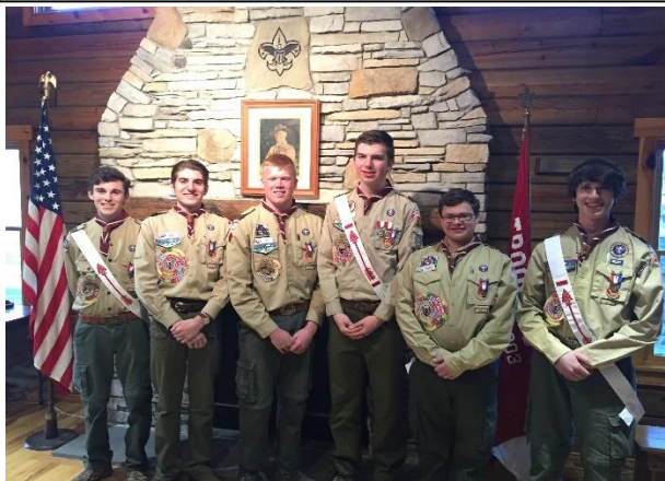
Troop 78's six newest Eagle Scouts

Click here for more pictures Click here for video