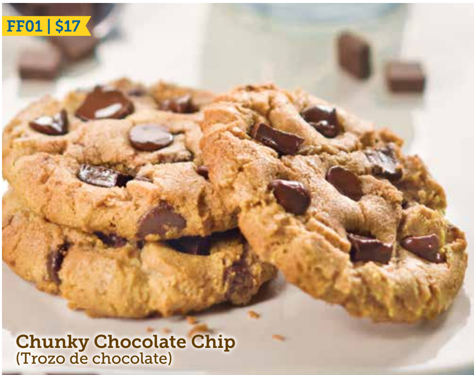
FF01 | $17