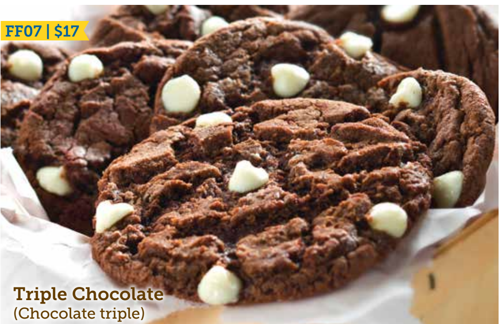
Triple Chocolate (Chocolate triple)

Developing their potential for premier leadership, personal growth through agricultural education.