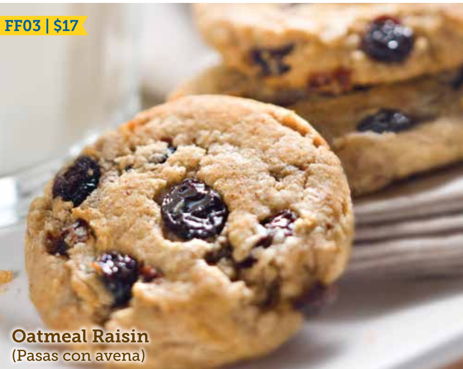
Oatmeal Raisin (Pasas con avena)