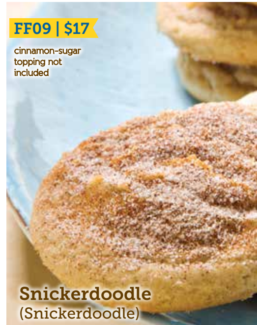
FF09 | $17