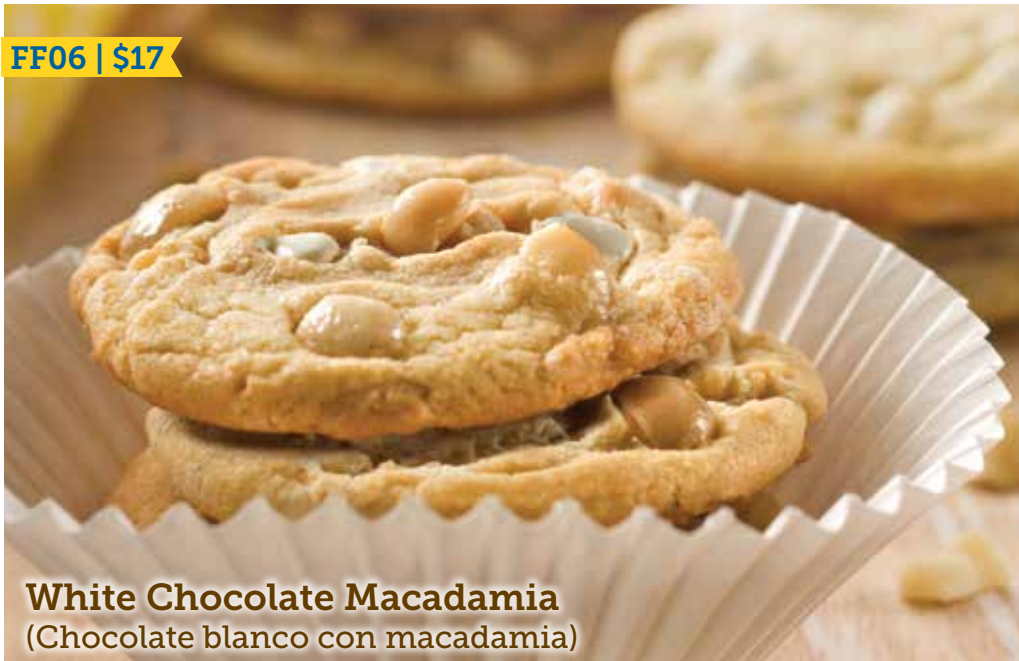
FF06 | $17