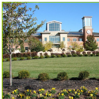
City of Mason Municipal Building Mason Ohio