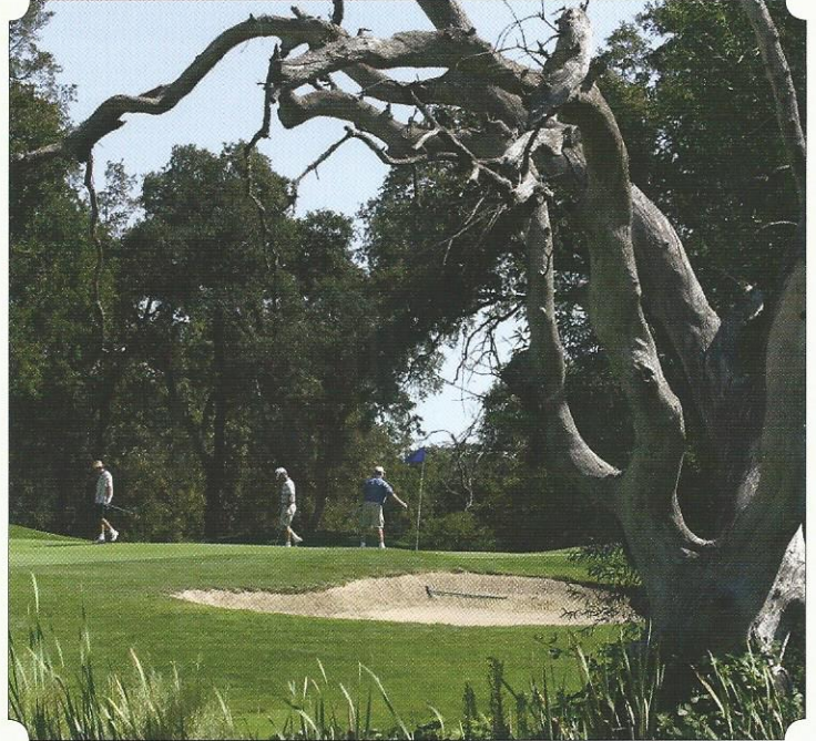
Home of Legends Sports Grill