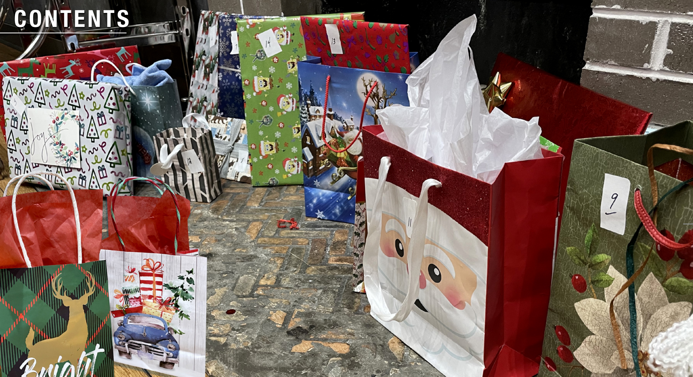
Member artwork wrapped and ready for gifting.

The presents were all wrapped, and placed on the hearth - waiting for members to unwrap some great art!