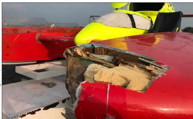
Unlimited Racing Group