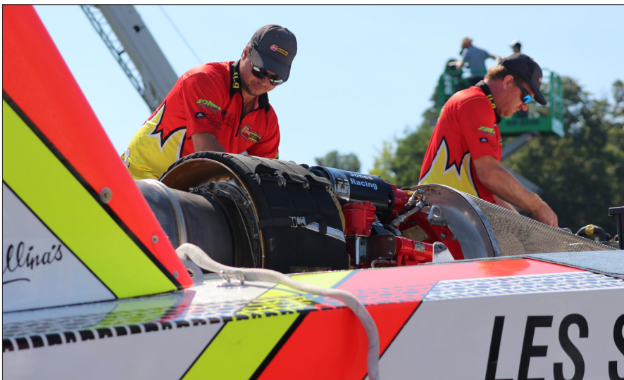
[Top] Among the boats from the Hydroplane and Raceboat Museum at the Seattle race were the "Winged Wonder" Pay 'n Pak of 1973 and the "Blue Blaster" AtlasVan Lines, the boat driven by Bill Muncey. [Middle] The new Miss HomeStreet drifts to the dock after a run on Lake Washington. [Above] The U-9 crew work on their boat's engine.

the fastest qualifier with a mark of 153.846 mph. Les Schwab Tires was second at 150.630 mph.