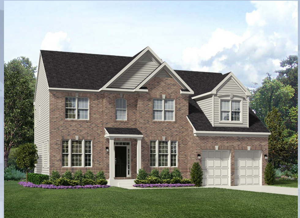
Elevation B (w/ Opt. Brick Front & Covered Porch)