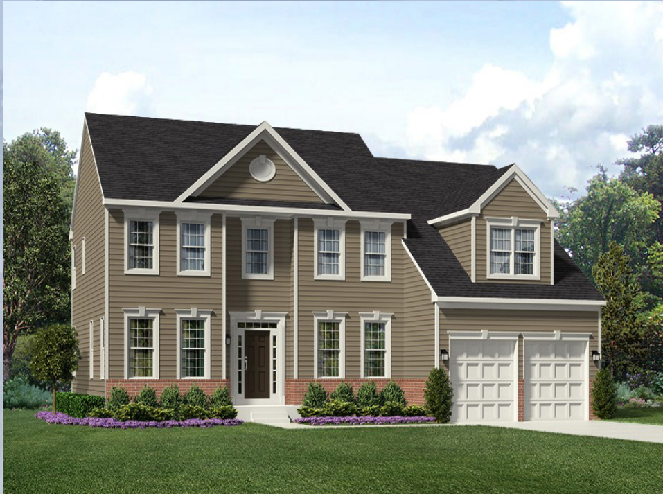
Elevation A (w/ Opt. Brick Watertable)

4-7 Bedrooms, 2.5-6 Bathrooms, 3,130-4,980 Square Feet