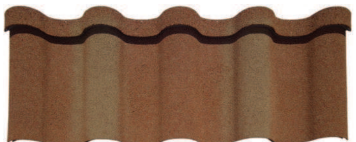
Villa Tile Venetian Gold