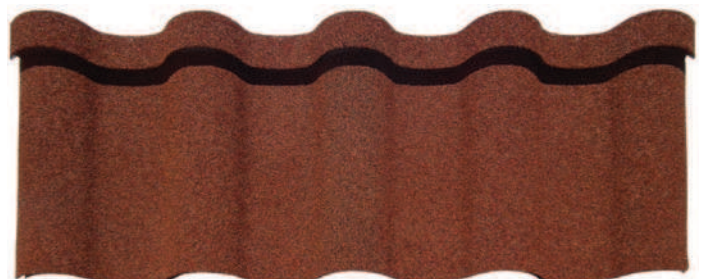
Villa Tile Capri Clay