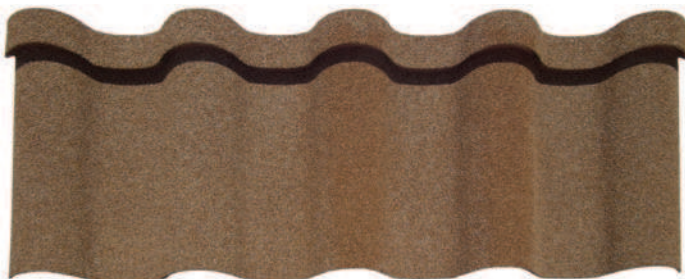
Villa Tile Amalfi Sand