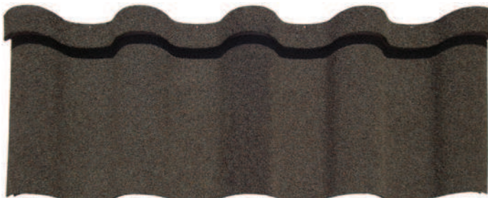
Villa Tile Pompeii Ash