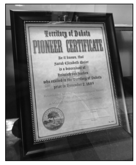
This is an example of the Pioneer Certificates the public can request through the Carnegie Resource Center.