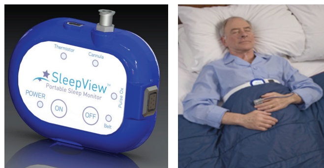
Fig. 2. Above - SleepView patient unit. Below - SleepView worn by a patient illustrating the hookup.

2 of 6 patients were male (33%). Age ranged from 26 to 55 years old (average was 43 years old). All recordings (6/6) were