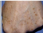
Beverly Hills Plastic Surgeon's Way To Remove Dark Spots Without Surgery.

We welcome user discussion on our site, under the following guidelines: