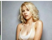
40 Hottest Female Celebrity Bodies of All Time