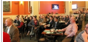
A crowd fills The Pines Eatery and Spirits on Thursday for a meeting discussing updates to the strategic plan of the Downtown Hazleton Alliance for Progress.

An arts district would serve as a catalyst for attracting businesses and residents to a revitalized downtown Hazleton that would boast a park, apartments, colleges and a central boulevard, members of a revitalization committee say.