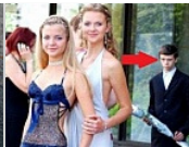
20 Prom Pictures That Went Horribly Wrong...