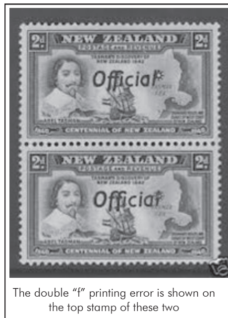
The double "ff" printing error is shown on the top stamp of these two

Sheets for the 2½d contained 160 stamps which resulted in one particular stamp which appeared in