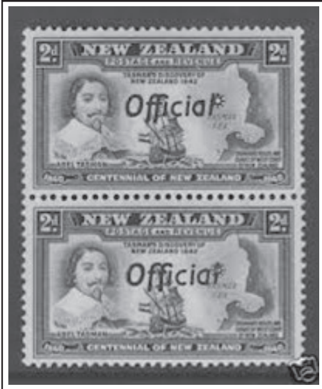
The double "f" printing error is shown on the top stamp of these two

In due time the printing caused the printing plates to wear and cause problems in all values of this set. The Printer Company tried to overcome this by replacing the worn Types with those that had not worn so much including new Types. However this replacing and including new Types caused the Printer Company to rearrange the position of the various Types which resulted in the double "ff" variety getting moved to Row 1 Column 10. The double "ff" variety also appeared in the other values of this set from that time on except for two values namely 1\frac{1}{2} d and 9d.