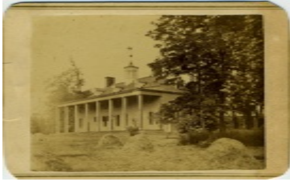
A Front View of Washington's Beloved Mt. Vernon

He also finds himself being drawn back into the controversy surrounding what the Democratic-Republicans argue was his favoritism for Britain over France. This has long been a cause celebre for men like Jefferson and Monroe, and Washington now encounters various pamphlets and messages he finds dismaying. He is particularly upset once again with Monroe, saying in a letter that he has exhibited a: