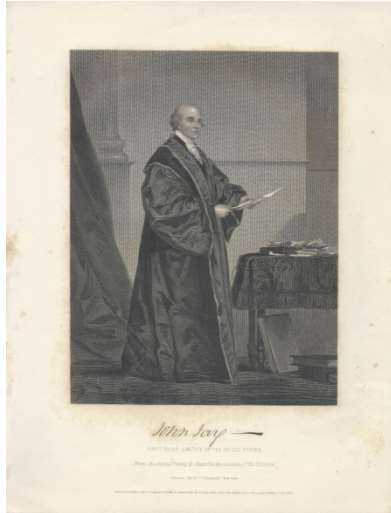
John Jay (1745-1829)

Washington is at Mt. Vernon in February 1793 when he learns that Robespierre's France has declared war on Britain. He quickly returns to Philadelphia and an emergency meeting where he poses 13 questions to his Cabinet members. These range from the tactical – “whether to receive a new French ambassador” – to the strategic – “whether to issue a proclamation of neutrality.”