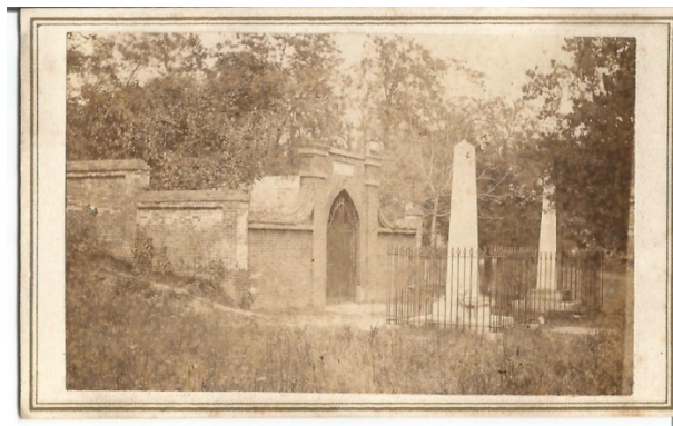
Washington's Burial Site at Mt. Vernon

With those words, the General passes. Elaborate memorials honoring Washington's death will follow across the nation, but on December 19, a simple ceremony, organized by his local Masonic Lodge, carries him to a final resting place on his farm.