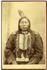
The Hunkpapa Warrior, Crow King (died 1884)