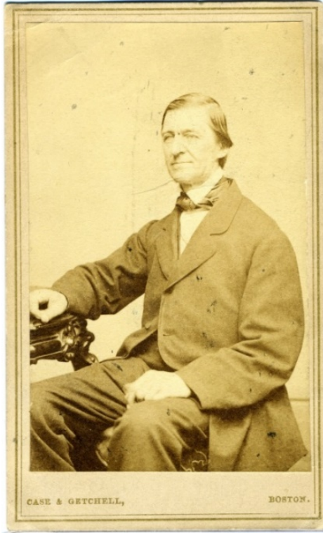
Ralph Waldo Emerson (1803-1882)

Transcendentalism is another movement that springs up at Harvard Divinity School during the 1820's and 1830's in conjunction with debates surrounding Unitarianism.