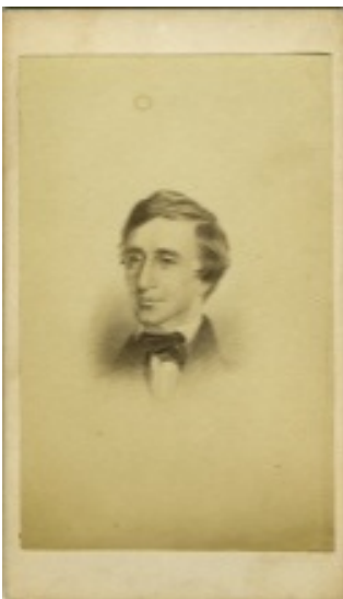
Henry David Thoreau (1817-1862)

If the Unitarians rely mainly on the intellect to guide its followers, the Transcendentalists find inspiration in the beauty, tranquility and lessons found in the great outdoors. For them, nature "transcends" the limited works of man, especially in the often debased realms of politics and organized religion, and also in the trend toward materialism and greed.