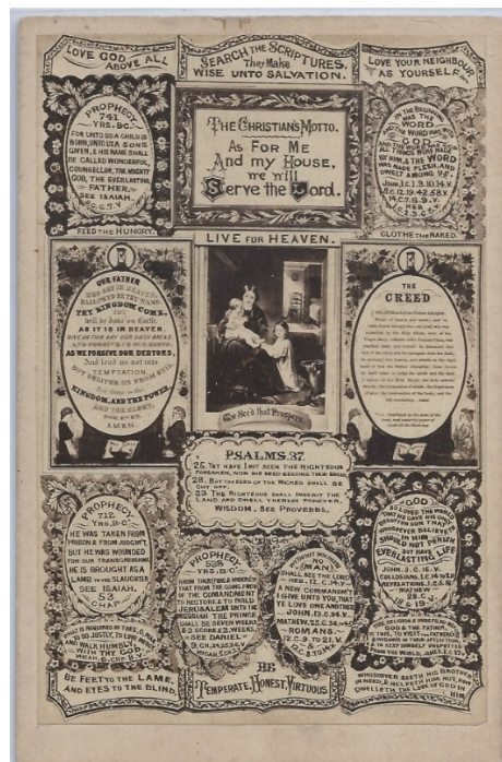
The Lord's Prayer and Other Religious Admonitions

The Second Great Awakening mirrors the fervency brought to bear by the great Puritan preacher, Jonathan Edwards. It sounds an Evangelical message that will henceforth become a part of America's religious landscape: