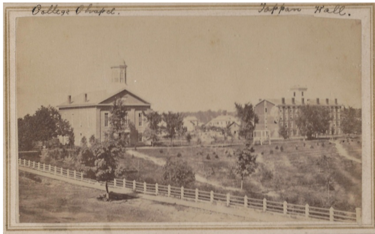
Oberlin College, Ohio, where the Reverend Finney served from 1835 to 1866.