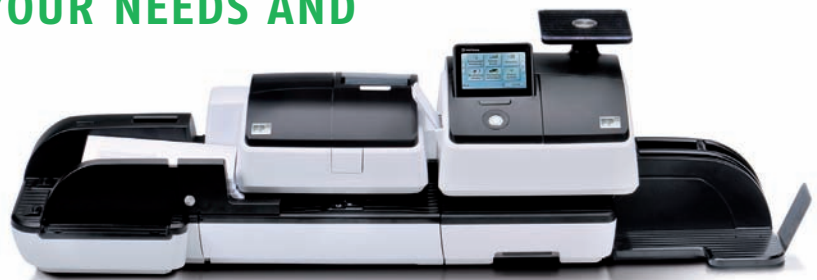
POSTBASE 85 WITH AUTO-FEEDER & SEALER

**Auto-feed available on 45, 65 & 85 models.