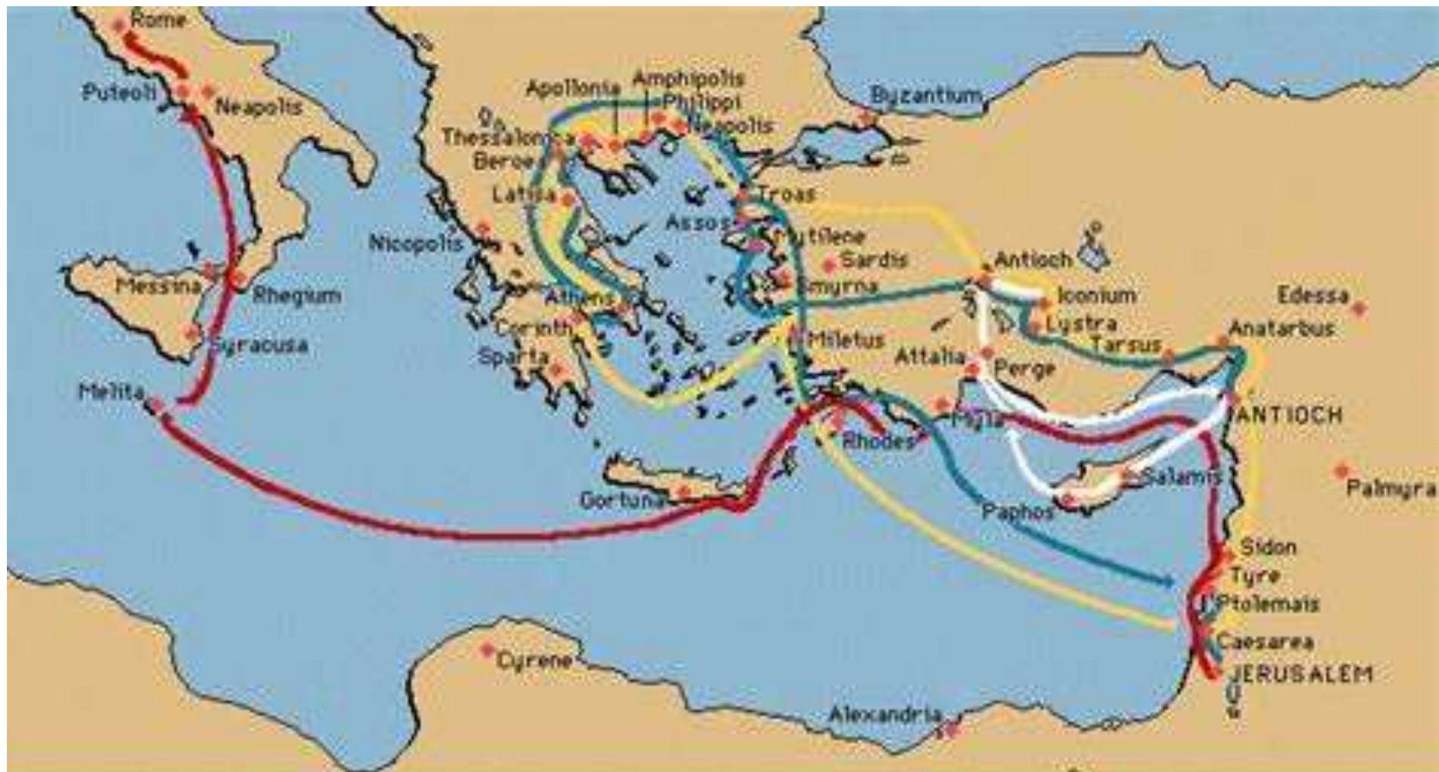
— Paul's First Journey — Paul's Second Journey — Paul's Third Journey — Paul's Journey To Rome