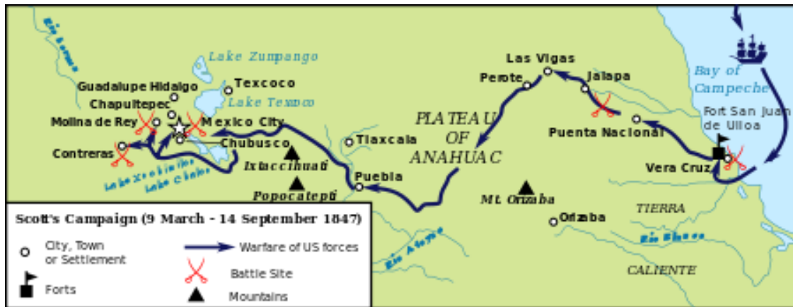
Map Of Winfield Scott's Mexican Campaign

Two weeks after Taylor's victory at Buena Vista, Scott executes America's first major amphibious invasion, landing some 11,000 American troops on Sacrificios Island, just below the fortress city of Veracruz. The operation involves repeated trips ashore by 65 surf boats, each packed with 100 men and equipment, and lasts for over six hours. Once ashore, the men march north to surround the Mexican enclave, which includes 5,000 local civilians in addition to 4,400 garrisoned troops, under General Juan Morales.