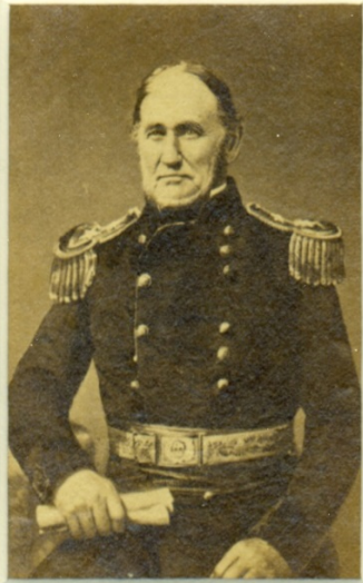
David Twiggs (1790-1862)

After securing his hold over Veracruz, Scott sends a lead force of 8,500 men out of the city on April 8, heading northwest along the national road, with General David Twiggs and his 2 nd Division in the lead.