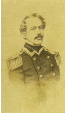
Robert E. Lee (1807-1870)