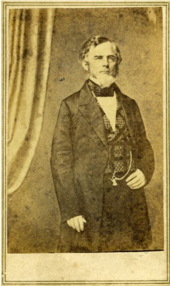
Gideon Pillow (1806-1878)

His troops along the eastern plateau surrender to Pillow's command, and Santa Anna himself barely escapes with his life, on foot, amidst a panicked general retreat west toward Jalapa.