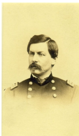
George B. McClellan (1826-1885)

On April 17 Scott divides his army and advances. His light left wing, under Polk's ex-law partner, General Gideon Pillow's, demonstrates against the Mexican forces east of the road, while his main body, comprising Twiggs' and Worth's divisions, swoop down on Santa Anna from behind Cerro Gordo.