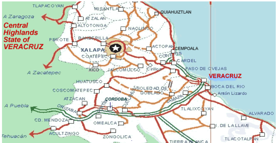
Map Showing City Of Xalapa Where Battle Of Cerro Gordo Occurs

After securing his hold over Veracruz, Scott sends a lead force of 8,500 men out of the city on April 8, heading northwest along the national road, with General David Twiggs and his 2 nd Division in the lead.