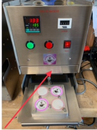
Press lever on front of unit to release The tray if stuck inside unit

1. PRESS THE MANUAL OPENING LEVER ON FRONT OF UNIT WHILE PLUGGED IN AND POWERED ON TO SEE IF TRAY WILL OPEN. IF TRAY OPENS TRY TO PRESS SEAL BUTTON TO SEE IF UNIT WILL CONTINUE TO WORK