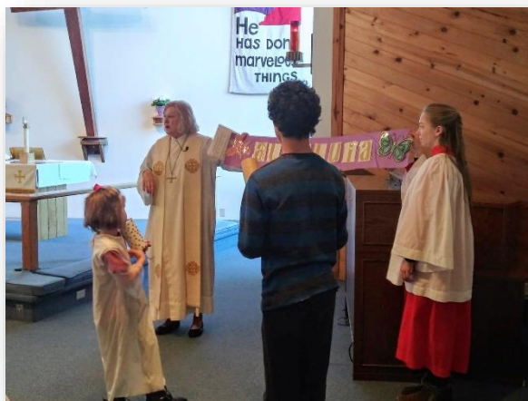
Putting the Alleluia away for Lent