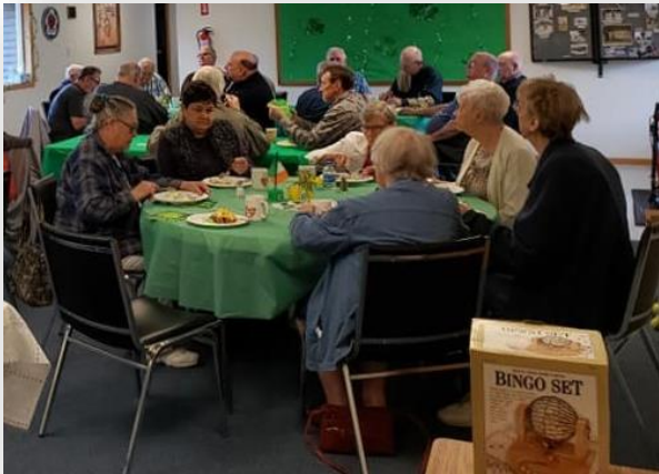
Bingo at the March Senior Social

The April Senior Social will be Thursday, April 18 th at noon in Litzer Hall. Watch for a sign-up sheet in the narthex.