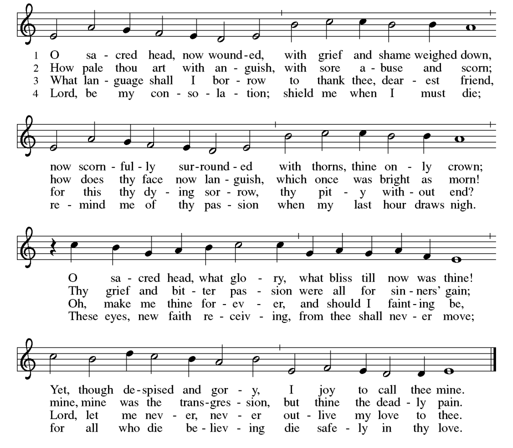
HYMN: O Sacred Head, Now Wounded (ELW 352)

<sup>54</sup>Then they seized him and led him away, bringing him into the high priest's house. But Peter was following at a distance. <sup>55</sup>When they had kindled a fire in the middle of the courtyard and sat down together, Peter sat among them. <sup>56</sup>Then a servant-girl, seeing him in the firelight, stared at him and said, "This man also was with him." <sup>57</sup>But he denied it, saying, "Woman, I do not know him." <sup>58</sup>A little later someone else, on seeing him, said, "You also are one of them." But Peter said, "Man, I am not!" <sup>59</sup>Then about an hour later still another kept insisting, "Surely this man also was with him; for he is a Galilean." <sup>60</sup>But Peter said, "Man, I do not know what you are talking about!" At that moment, while he was still speaking, the cock crowed. <sup>61</sup>The Lord turned and looked at Peter. Then Peter remembered the word of the Lord, how he had said to him, "Before the cock crows today, you will deny me three times." <sup>62</sup>And he went out and wept bitterly.