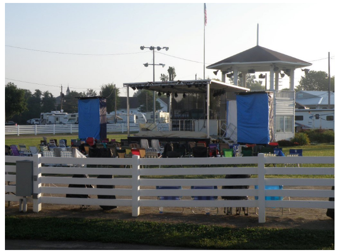
Early Morning Shot Getting Ready For The Fun